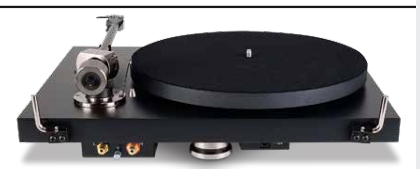
ABOVE: Stereo RCA sockets are mounted under the left of the plinth, PSU input to the right. Three machined feet screw into place for levelling and vibration control

Debut PRO yields nothing, as I heard with William Bell's The Soul Of A Bell [Speakers Corner STAX S719]. This is more about voice than anything else, despite the usual peerless backing all Stax releases employ.